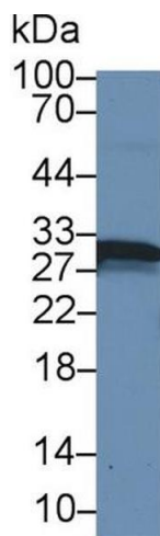
Image 2. Western Blot; Sample: Rat Cerebrum lysate; Primary Ab: 1µg/ml Rabbit Anti-Human CA1 Antibody Second Ab: 0.2µg/mL HRP-Linked Caprine Anti-Rabbit IgG Polyclonal Antibody (Catalog: SAA544Rb19)