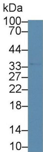
Western Blotting Image 2. Western Blot; Sample: Mouse Heart lysate; Primary Ab: 5µg/ml Rabbit Anti-Simian CTSK Antibody Second Ab: 0.2µg/mL HRP-Linked Caprine Anti-Rabbit IgG Polyclonal Antibody (Catalog: SAA544Rb19)