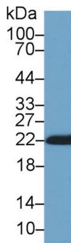
Image 2. Western Blot; Sample: Rat Skin lysate; Primary Ab: 1µg/ml Rabbit Anti-Rat CYPB Antibody Second Ab: 0.2µg/mL HRP-Linked Caprine Anti-Rabbit IgG Polyclonal Antibody (Catalog: SAA544Rb19)