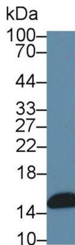
Western Blotting Image 2. Western Blot; Sample: Rat Small intestine lysate; Primary Ab: 1µg/ml Rabbit Anti-Rat FABP2 Antibody Second Ab: 0.2µg/mL HRP-Linked Caprine Anti-Rabbit IgG Polyclonal Antibody (Catalog: SAA544Rb19)