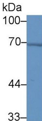
Image 3. Western Blot; Sample: Porcine Cerebrum lysate; Primary Ab: 2µg/ml Rabbit Anti-Mouse HSPA1A Antibody Second Ab: 0.2µg/mL HRP-Linked Caprine Anti-Rabbit IgG Polyclonal Antibody (Catalog: SAA544Rb19)

Image 2. Western Blot; Sample: Mouse Cerebrum lysate; Primary Ab: 2µg/ml Rabbit Anti-Mouse HSPA1A Antibody Second Ab: 0.2µg/mL HRP-Linked Caprine Anti-Rabbit IgG Polyclonal Antibody (Catalog: SAA544Rb19)