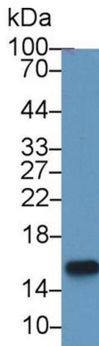
Image 2. Western Blot; Sample: Human Urine; Primary Ab: 1µg/ml Rabbit Anti-Human MSMb Antibody Second Ab: 0.2µg/mL HRP-Linked Caprine Anti-Rabbit IgG Polyclonal Antibody (Catalog: SAA544Rb19)