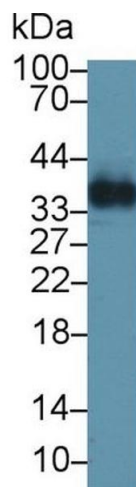
Image 2. Western Blot; Sample: Human Lung lysate; Primary Ab: 1µg/ml Rabbit Anti-Human OGN Antibody Second Ab: 0.2µg/mL HRP-Linked Caprine Anti-Rabbit IgG Polyclonal Antibody (Catalog: SAA544Rb19)