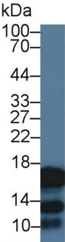
Western Blotting Image 2. Western Blot; Sample: Human Saliva; Primary Ab: 3µg/ml Rabbit Anti-Human CST2 Antibody Second Ab: 0.2µg/mL HRP-Linked Caprine Anti-Rabbit IgG Polyclonal Antibody (Catalog: SAA544Rb19)