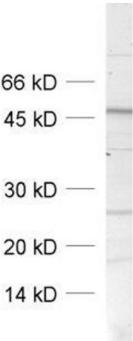
Image 2. dilution: 1 : 1000, sample: crude synaptosomal fraction of rat brain (P2)