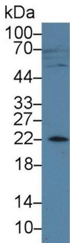
Image 2. Western Blot; Sample: Human Jurkat cell lysate; Primary Ab: 3µg/ml Rabbit Anti-Human AMELX Antibody Second Ab: 0.2µg/mL HRP-Linked Caprine Anti-Rabbit IgG Polyclonal Antibody (Catalog: SAA544Rb19)