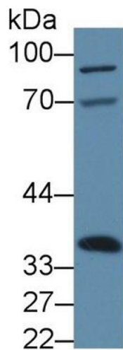
Western Blotting Image 1. Western Blot; Sample: Mouse Liver lysate; ;Primary Ab: 3µg/ml Rabbit Anti-Mouse ANXA4 Antibody;Second Ab: 0.2µg/mL HRP-Linked Caprine Anti-Rabbit IgG Polyclonal Antibody;(Catalog: SAA544Rb19)