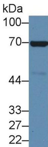
Image 2. Western Blot; Sample: Mouse Heart lysate; Primary Ab: 2µg/ml Rabbit Anti-Mouse ANXA6 Antibody Second Ab: 0.2µg/mL HRP-Linked Caprine Anti-Rabbit IgG Polyclonal Antibody (Catalog: SAA544Rb19)