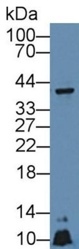
Image 2. Western Blot; Sample: Mouse Liver lysate; Primary Ab: 5µg/ml Rabbit Anti-Rat APOA5 Antibody Second Ab: 0.2µg/mL HRP-Linked Caprine Anti-Rabbit IgG Polyclonal Antibody (Catalog: SAA544Rb19)