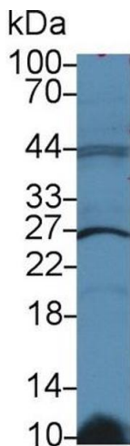
Image 2. Western Blot; Sample: Human Raji cell lysate; Primary Ab: 2µg/ml Rabbit Anti-Rat GSTk1 Antibody Second Ab: 0.2µg/mL HRP-Linked Caprine Anti-Rabbit IgG Polyclonal Antibody (Catalog: SAA544Rb19)