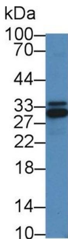
Image 2. Western Blot; Sample: Mouse Liver lysate; Primary Ab: 2µg/mL Rabbit Anti-Human IKBIP Antibody Second Ab: 0.2µg/mL HRP-Linked Caprine Anti-Rabbit IgG Polyclonal Antibody (Catalog: SAA544Rb19)