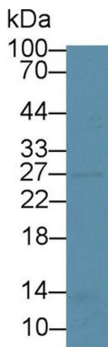
Image 2. Western Blot; Sample: Mouse Liver lysate; Primary Ab: 1µg/ml Rabbit Anti-Mouse NNMT Antibody Second Ab: 0.2µg/mL HRP-Linked Caprine Anti-Rabbit IgG Polyclonal Antibody (Catalog: SAA544Rb19)