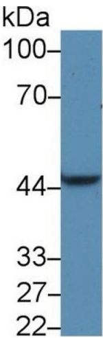
Image 2. Western Blot; Sample: Rat Liver lysate; Primary Ab: 5µg/ml Rabbit Anti-Human PDK1 Antibody Second Ab: 0.2µg/mL HRP-Linked Caprine Anti-Rabbit IgG Polyclonal Antibody (Catalog: SAA544Rb19)