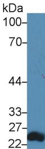
Image 2. Western Blot; Sample: Mouse Lung lysate; Primary Ab: 5µg/ml Rabbit Anti-Human RAGE Antibody Second Ab: 0.2µg/mL HRP-Linked Caprine Anti-Rabbit IgG Polyclonal Antibody (Catalog: SAA544Rb19)