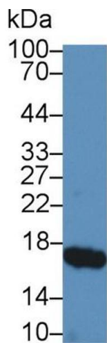
Western Blotting Image 2. Western Blot; Sample: Porcine Small intestine lysate; Primary Ab: 5µg/ml Rabbit Anti-Porcine RBP2 Antibody Second Ab: 0.2µg/mL HRP-Linked Caprine Anti-Rabbit IgG Polyclonal Antibody (Catalog: SAA544Rb19)