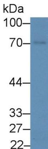
Image 2. Western Blot; Sample: Mouse Heart lysate; Primary Ab: 2µg/mL Rabbit Anti-Mouse SCG2 Antibody Second Ab: 0.2µg/mL HRP-Linked Caprine Anti-Rabbit IgG Polyclonal Antibody (Catalog: SAA544Rb19)