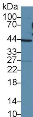
Image 2. Western Blot; Sample: Human HepG2 cell lysate; Primary Ab: 2µg/ml Rabbit Anti-Human TAZ Antibody Second Ab: 0.2µg/mL HRP-Linked Caprine Anti-Rabbit IgG Polyclonal Antibody (Catalog: SAA544Rb19)