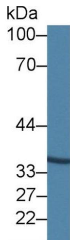
Western Blotting Image 1. Western Blot; Sample: Human 293T cell lysate; Primary Ab: 2µg/ml Rabbit Anti-Human ANXA9 Antibody Second Ab: 0.2µg/mL HRP-Linked Caprine Anti-Rabbit IgG Polyclonal Antibody (Catalog: SAA544Rb19)