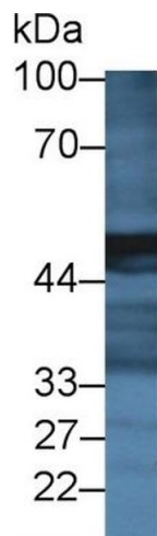
Image 1. Western Blot; Sample: Mouse Pancreas lysate; Primary Ab: 2µg/ml Rabbit Anti-Rat CPA2 Antibody Second Ab: 0.2µg/mL HRP-Linked Caprine Anti-Rabbit IgG Polyclonal Antibody (Catalog: SAA544Rb19)