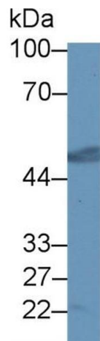
Image 1. Western Blot; Sample: Human K562 cell lysate; Primary Ab: 1µg/ml Rabbit Anti-Human PA2G4 Antibody Second Ab: 0.2µg/mL HRP-Linked Caprine Anti-Rabbit IgG Polyclonal Antibody (Catalog: SAA544Rb19)