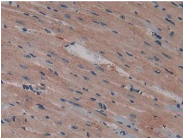
Image 2. Used in DAB staining on formalin fixed paraffin-embedded kidney tissue