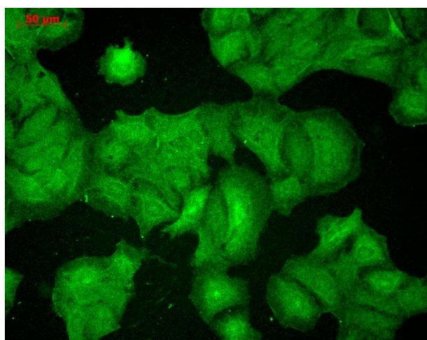
Image 1. Immunohistochemistry analysis using Mouse Anti-PSD95 Monoclonal Antibody, Clone 7E3 . Tissue: Neocortex. Species: Rat. Primary Antibody: Mouse Anti-PSD95 Monoclonal Antibody at 1:1000.