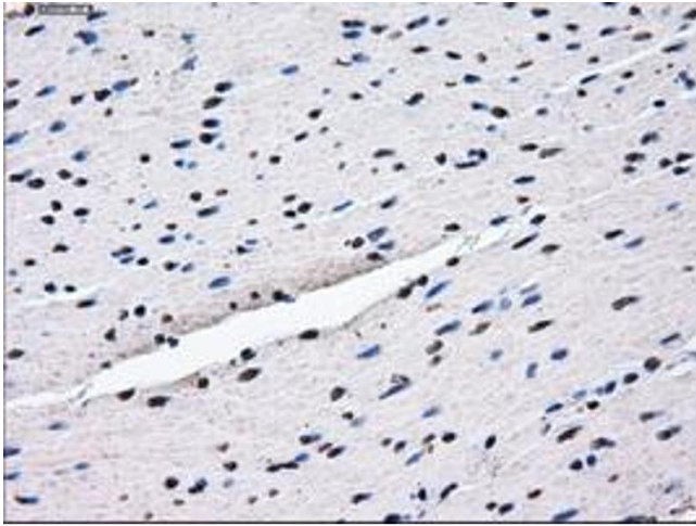
Image 2. Immunohistochemical staining of paraffin-embedded Ovary tissue using anti-HDAC10 mouse monoclonal antibody. (ABIN2453109, Dilution 1:50)