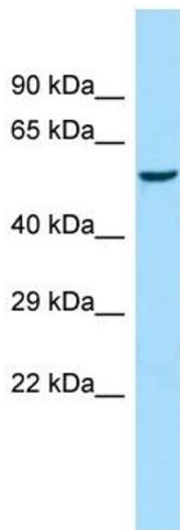
Image 1. Host: Rabbit Target Name: AMY1 Sample Tissue: Mouse Skeletal Muscle Antibody Dilution: 1ug/ml