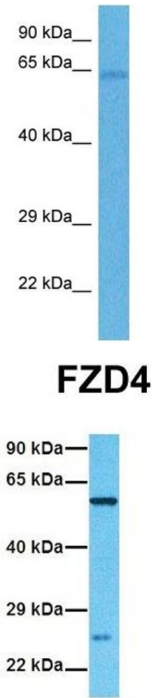
Image 2. Host: Rabbit Target Name: FZD4 Sample Tissue: Human Lung Tumor Antibody Dilution: 1ug/ml

Image 3. Host: Rabbit Target Name: FZD4 Sample Tissue: Human Fetal Liver Antibody Dilution: 1.0ug/ml