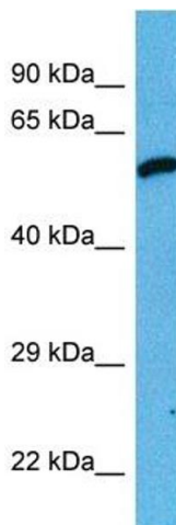
Image 1. WB Suggested Anti-DES Antibody Titration: 0.2-1 ug/ml ELISA Titer: 1:1562500 Positive Control: Human Muscle