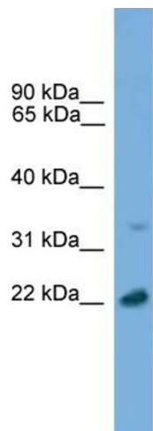
Rabbit Anti-AP3S1 Antibody Catalog Number: ARP51936 Lot Number: QC24091 Lane: 293T Cell Lysate Antibody Titration: 1.0µg/ml Gel Concentration: 12%