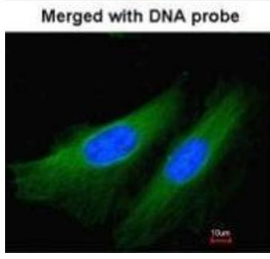
Image 3. ICC/IF Image Immunofluorescence analysis of paraformaldehyde-fixed HeLa, using HL, antibody at 1:200 dilution.

Please check the product details page for more images. Overall 5 images are available for ABIN2856650.