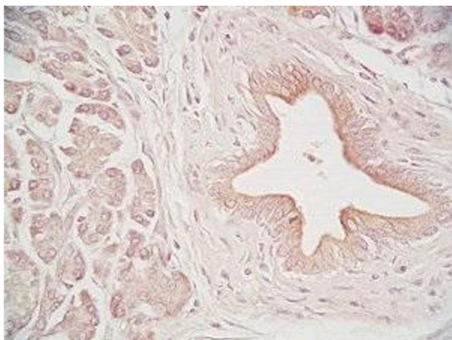
Image 1. Human pancreas tissue was stained by Rabbit Anti-Urocortin II (Human) Serum