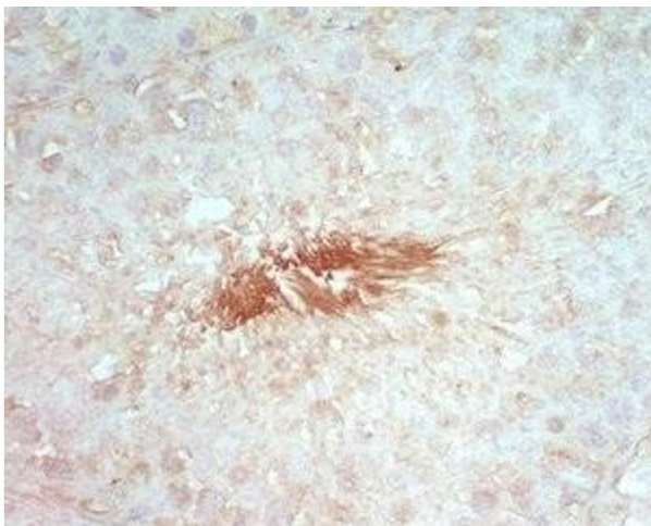
Image 1. Mouse heart tissue stained by rabbit Anti-Beta Defensin 8 (Mouse) Antiserum