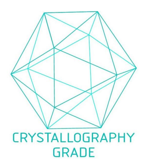
Image 1. "Crystallography Grade" protein due to multi-step, protein-specific purification process