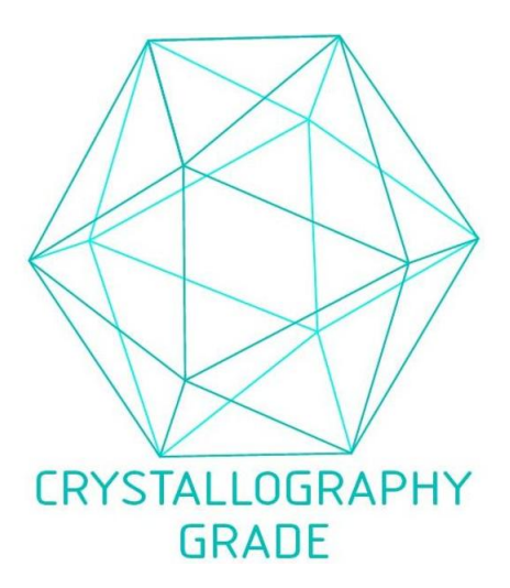
Image 1. "Crystallography Grade" protein due to multi-step, protein-specific purification process