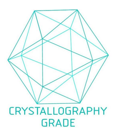
Image 1. "Crystallography Grade" protein due to multi-step, protein-specific purification process