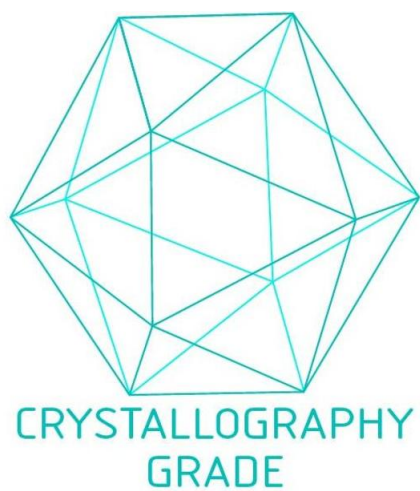
Image 2. „Crystallography Grade“ protein due to multi-step, protein-specific purification process