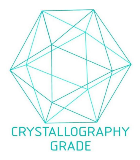
Image 1. "Crystallography Grade" protein due to multi-step, protein-specific purification process