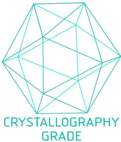
Image 2. „Crystallography Grade“ protein due to multi-step, protein-specific purification process