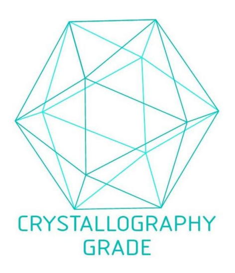
Image 1. "Crystallography Grade" protein due to multi-step, protein-specific purification process