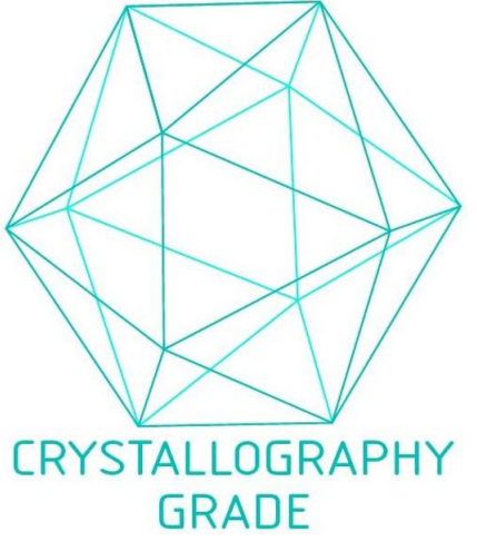
Image 1. "Crystallography Grade" protein due to multi-step, protein-specific purification process