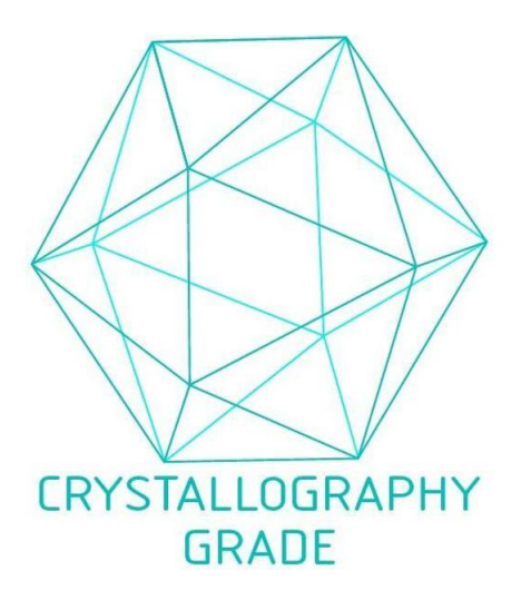
Image 1. "Crystallography Grade" protein due to multi-step, protein-specific purification process