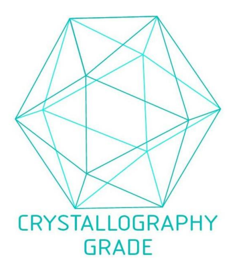
Image 1. "Crystallography Grade" protein due to multi-step, protein-specific purification process