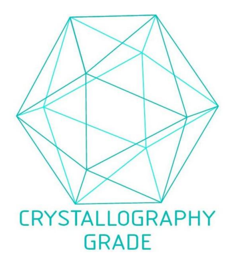
Image 1. "Crystallography Grade" protein due to multi-step, protein-specific purification process