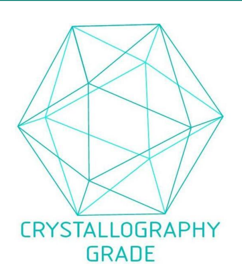
Image 1. "Crystallography Grade" protein due to multi-step, protein-specific purification process