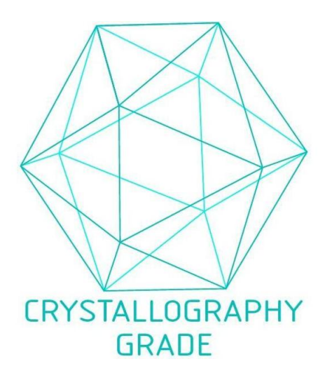
Image 1. "Crystallography Grade" protein due to multi-step, protein-specific purification process