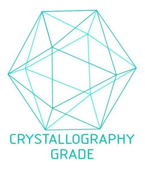
Image 1. "Crystallography Grade" protein due to multi-step, protein-specific purification process