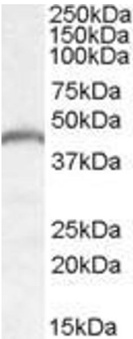
Image 2. Antibody (0.05µg/ml) staining of Mouse Heart lysate (35µg protein in RIPA buffer). Primary incubation was 1 hour. Detected by chemiluminescence.