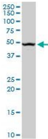
Image 2. UPB1 monoclonal antibody (M09), clone 3F12. Western Blot analysis of UPB1 expression in Jurkat .